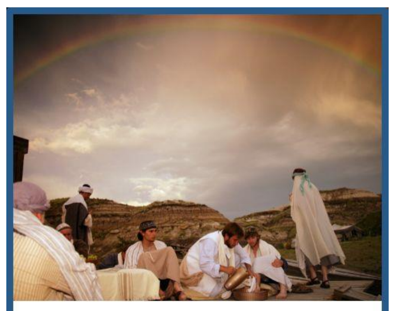
Seeing the crowds, he went up on the mountain, and when he sat down, his disciples came to him. Matthew 5: I